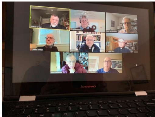
One of many Zoom meetings with consultants from the USCCB, CADEIO, and Catholic Climate Covenant