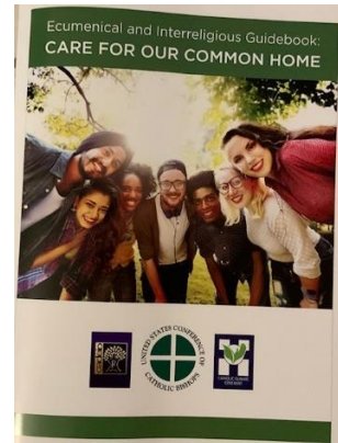
The finished product, Ecumenical and Interreligious Guidebook: Care for Our Common Home , launched January 25

A casual conversation over a table of books on display at the National Workshop on Christian Unity in 2019 began a project which extended from the summer of 2019 through December 2020. A committee representing several offices of the United States Conference of Catholic Bishops, CADEIO (Catholic Association of Diocesan Ecumenical and Interreligious Officers), and Catholic Climate Covenant was tasked with the project of producing a contribution to ongoing implementation of Laudato Si' . Pope Francis has urged the whole Church to embark on a 7-year plan to make a real difference in our attitudes and actions on behalf of "Our Common Home," planet Earth.