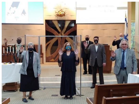
Presenters and musicians at the Winter Holy Days observance at Beth Yam Synagogue, Hilton Head