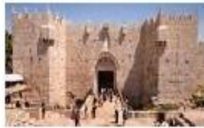
Church of the Nativity, Way of the Cross, Holy