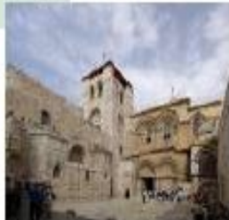
Sepulchre, Jerusalem Gate