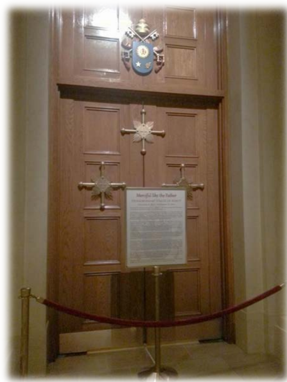
Holy Door -- National Basilica of the Immaculate Conception, Washington, DC

Each cathedral should designate a door as a Holy Door. It should be accessible to pilgrims, including those with disabilities. Preferably, use an interior door if the church has a vestibule. Most cathedrals have multiple doors for egress and exit. Choose a door that is one of several, that is, other doors may be used for crowds to go through, especially in case of emergency. Check with your local fire department for any local codes.